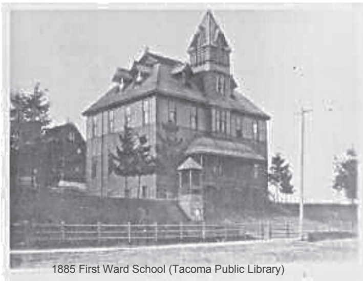
1885 First Ward School

B y 1877, there were about 100 school age children in Old Tacoma. In 1885, ten years after the wooden school had burned, a new school was built up the hill at 1210 N Yakima, midway between N 12th and 13th Streets. It was, according to the Tacoma Daily Ledger: "the handsomest of the wooden school buildings of the city...and caused a howl from the taxpayers. It was too expensive, having cost $5000; it was away out in the woods, and it was big enough to hold all the pupils there would be for 100 years." In 1889, the Second Presbyterian (later Immanuel) used the school building for services, before their 1891 church was built on N 9th and J Streets.