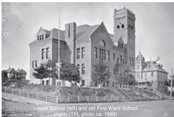
Lowell School (left) and old First Ward School (right)