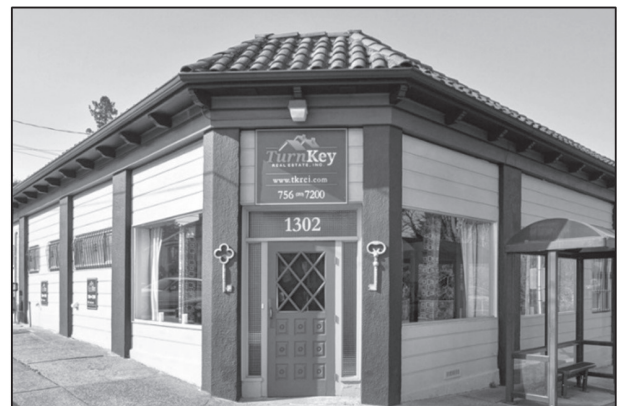
1302 N I Street Tacoma, WA 98403 www.tkrei.com