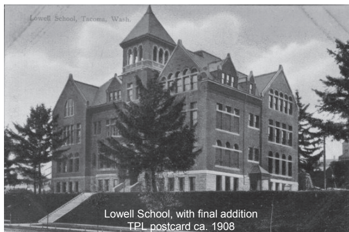
Lowell School, with final addition TPL postcard ca. 1908

In 1892 a brick school was planned to replace the First Ward school, which was moved to one side to the edge of the grounds, facing the side of the new building. The new school was designed by the firm of Bullard and Haywood. From the New England Magazine, 1893, "Tacoma is noted throughout the Pacific Northwest today for the excellence of her public schools. There are thirteen public ward schools in the city. Each school is named after some national celebrity... On the birthdays of these patron saints exercises are held in the respective schools, designed to promote a spirit of patriotism in the young scholars." In 1891 the American poet and diplomat, James Russell Lowell, had died. So Tacoma's first school, on the property between N. Yakima and I Streets, became Lowell School. Originally it was to be built in two halves, with a tower entrance in the center. The first half and the tower were finished by 1893. Albert H. Haywood left Tacoma in 1894. The old wooden First Ward school was moved down a block. Later, Lowell received its addition, not quite symmetrical, perhaps due to lack of funds.